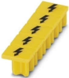
Warning cover, 5-pos., for terminal width: 5.2 mm

Please be informed that the data shown in this PDF Document is generated from our Online Catalog. Please find the complete data in the user's documentation. Our General Terms of Use for Downloads are valid ( http://phoenixcontact.com/download )